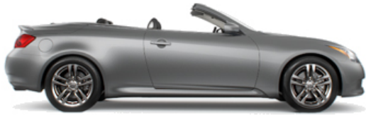
US Model Shown